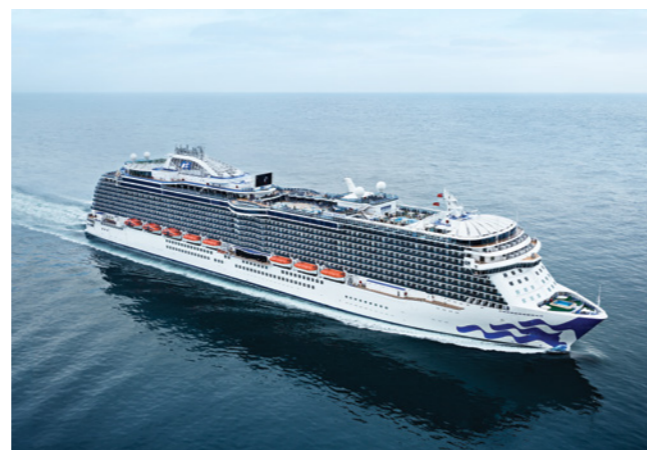
Regal Princess ®