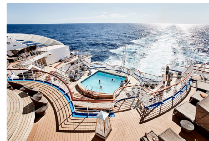
Diamond Princess ®