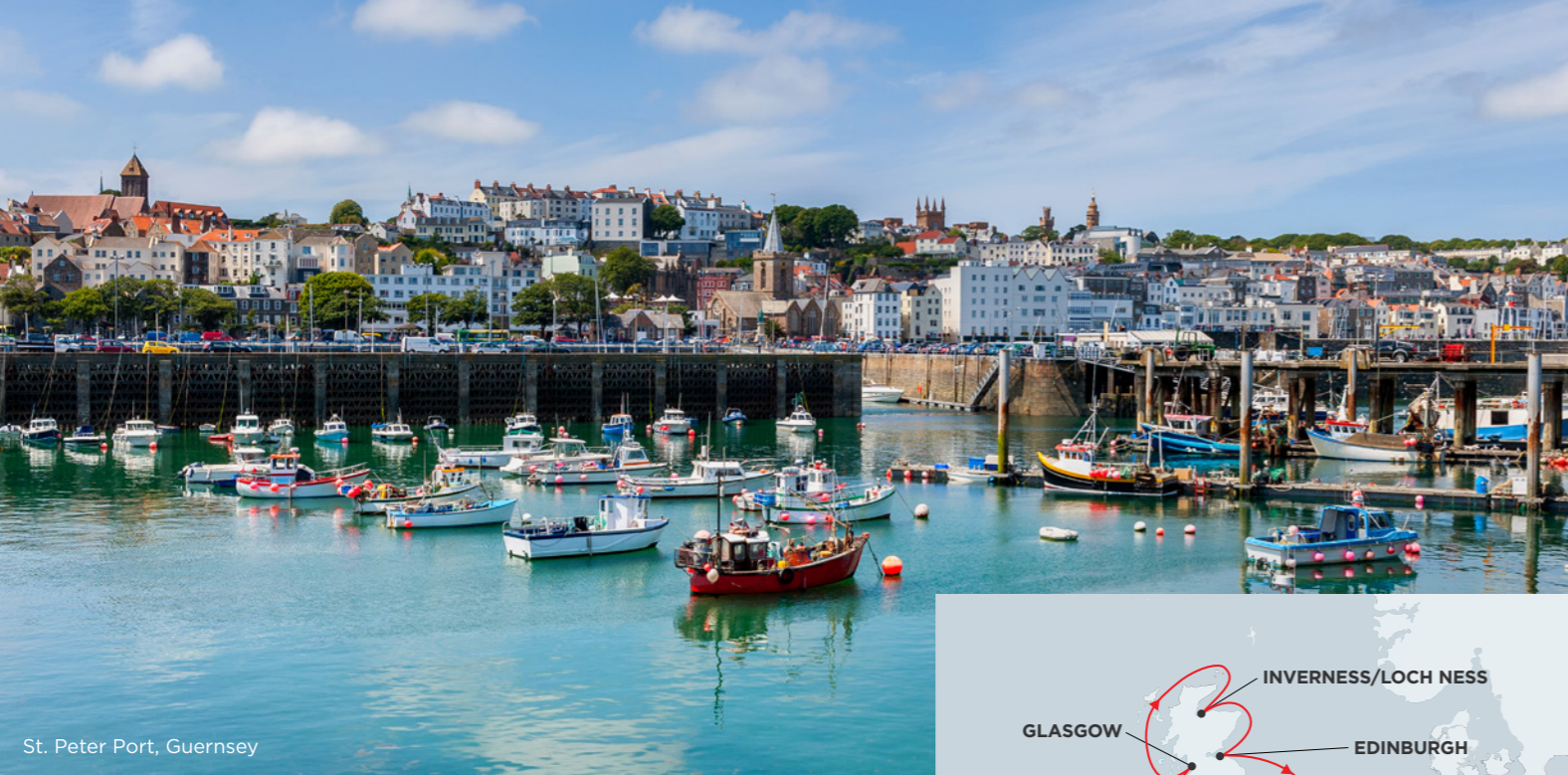
St. Peter Port, Guernsey