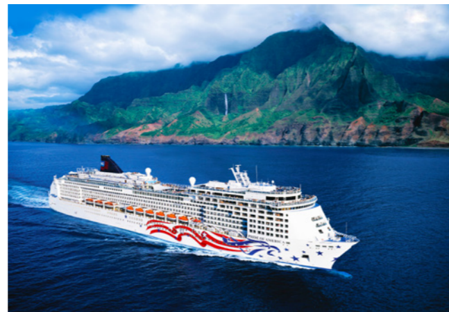
Pride of America