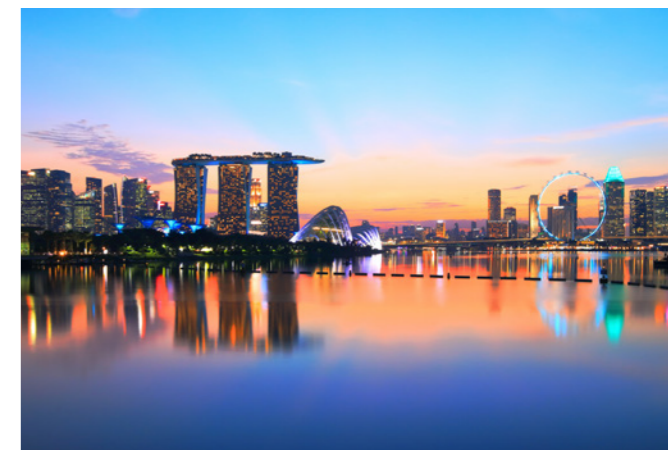
Marina Bay, Singapore