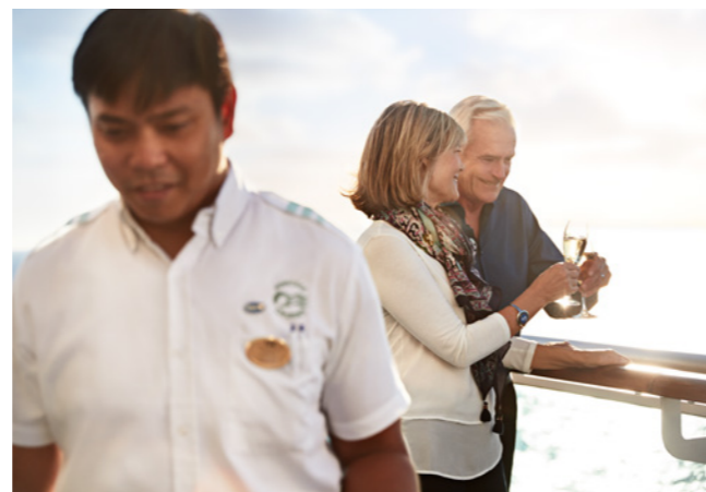
Princess MedallionClass™ onboard Regal Princess ®