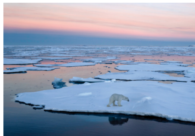
Arctic Ocean north of Svalbard

Upgrade from a Twin Window to a Junior Suite for just $2,119* pp !